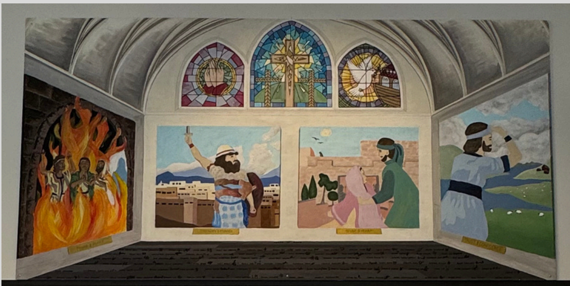
2022 God is with us in the fire