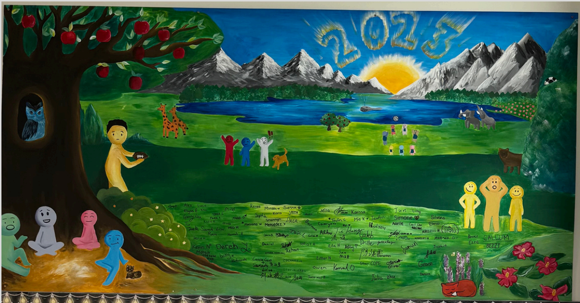
2023 Finding Eden, loving His creation

The Year 10 leaving murals. Each mural has a theme and every student in the year group gets to write their name on the design.