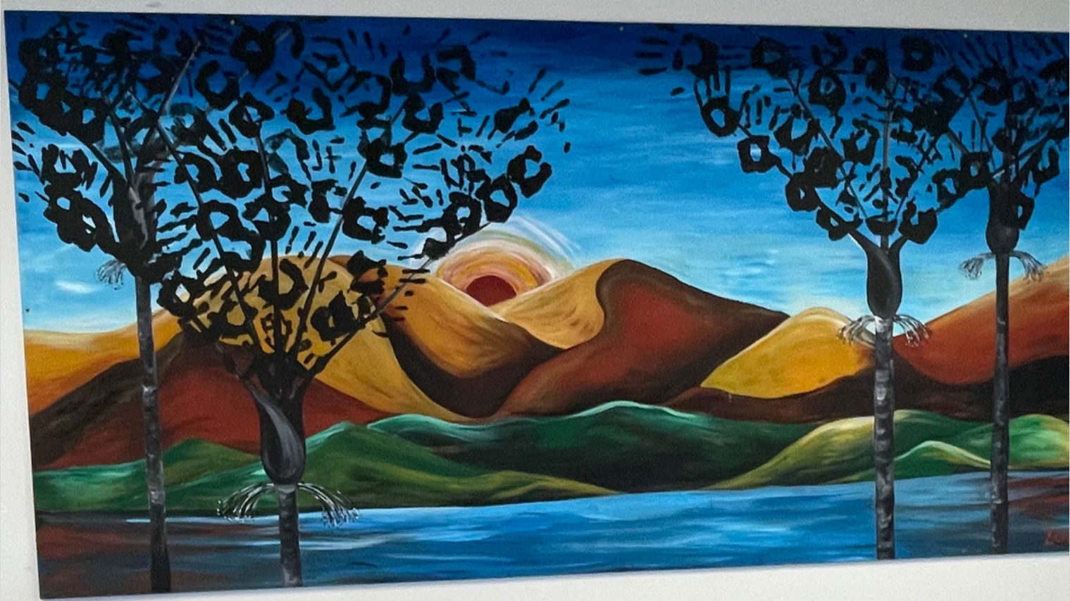
Each palm carries handprints

2019 finding peace in some wilderness moments