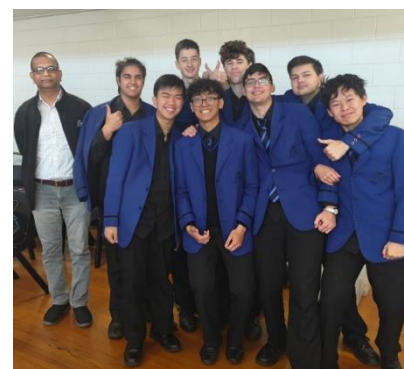
TABLE TENNIS TERM 2

The Inter School Table Tennis Competition has gone well as we have a B-grade team and two C-grade teams. These teams play every Friday at Saint Kentigern's College and have done well in their respective grades. The addition of new players is also exciting as they learn the ins-and-outs of the sport while challenging themselves.