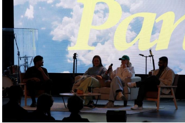
Question and Answer forum